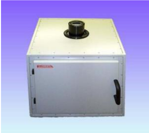
DB2 Dark Box